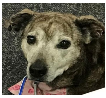
Animal Reiki - Client