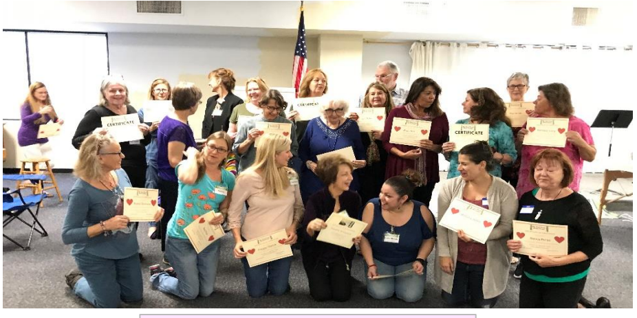
Oops!! - Not quite ready!!!